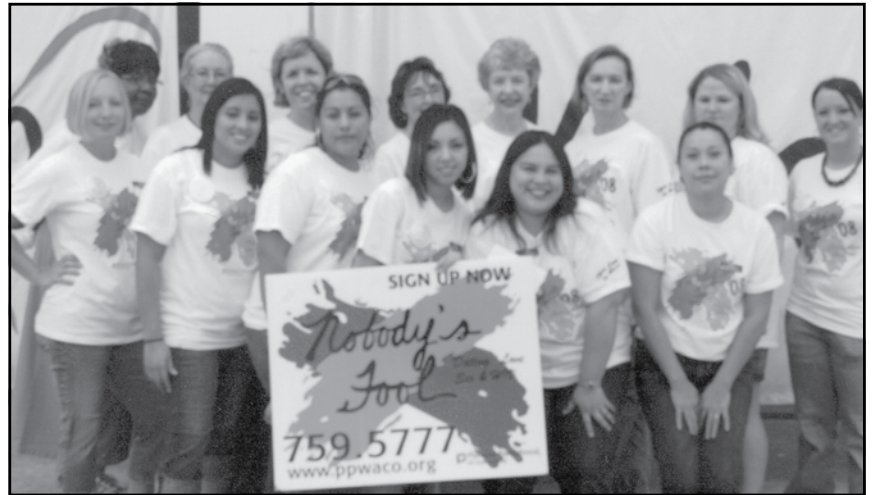
Pictured: Our 2008 Volunteers

Help us celebrate the 19th year of Nobody's Fool ®